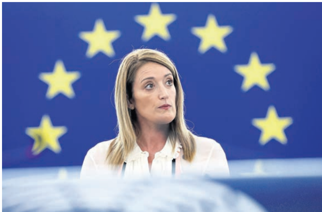
European Parliament President Roberta Metsola delivers her speech during a special session on lobbying Monday, Dec. 12, 2022 in Strasbourg, eastern France.